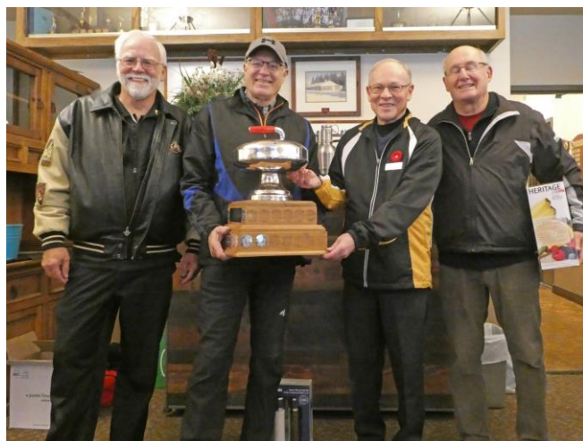
' A ' EVENT WINNERS