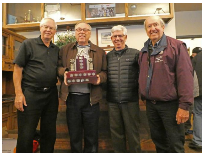
' C ' EVENT WINNERS