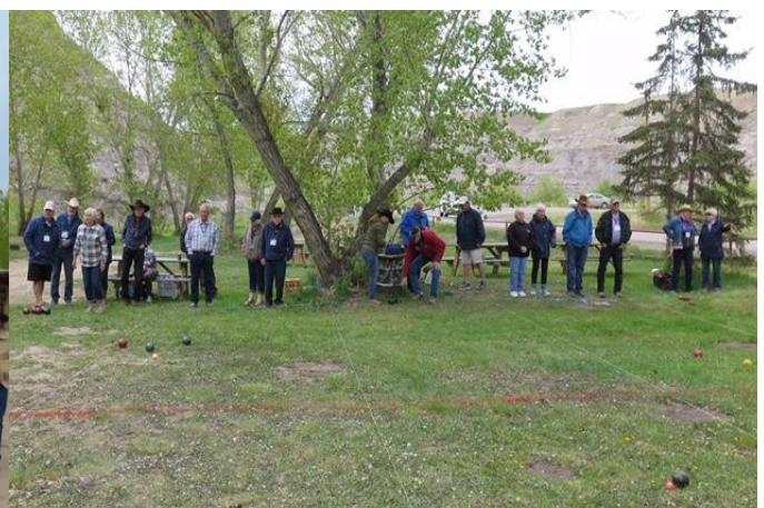
Some Bocce participants