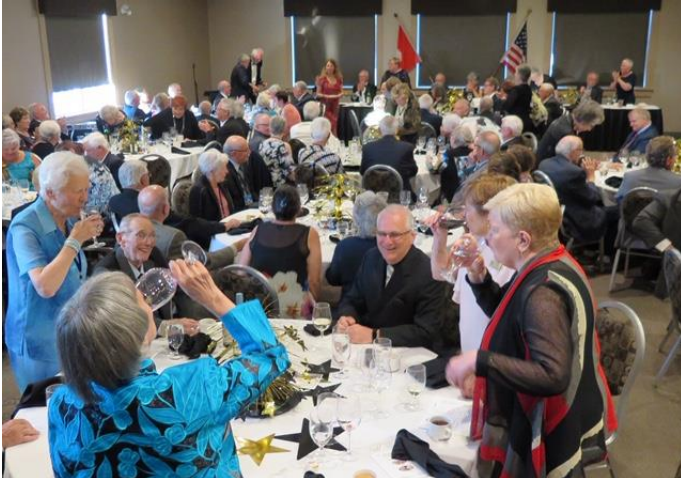
Left – part of the enthusiastic audience