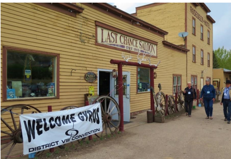
The historic Rosedeer Hotel at Wayne